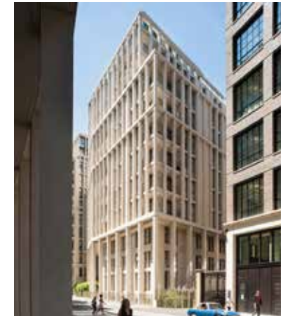
Abell and Cleveland SW1P 4LH