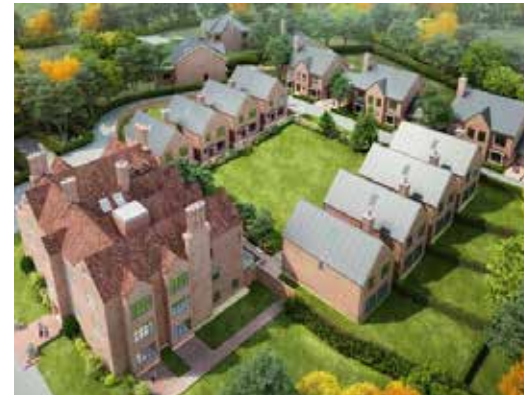
Slaugham Manor RH17 6AL