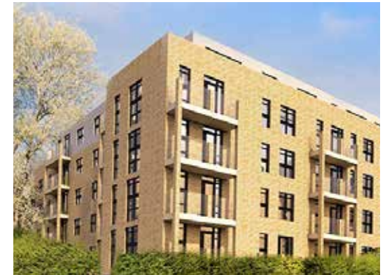
Whitehawk Way BN2 5QJ