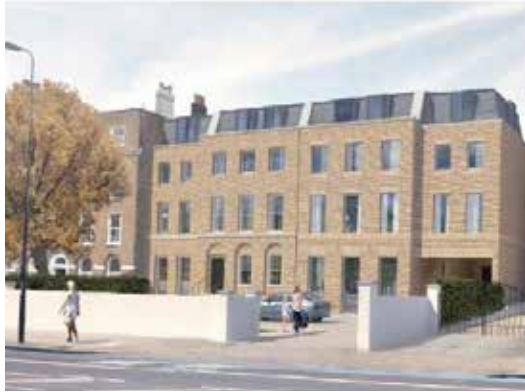
Clapham Road SW9 9BT