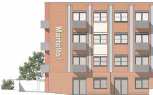
Martello Lofts BN3 5SE