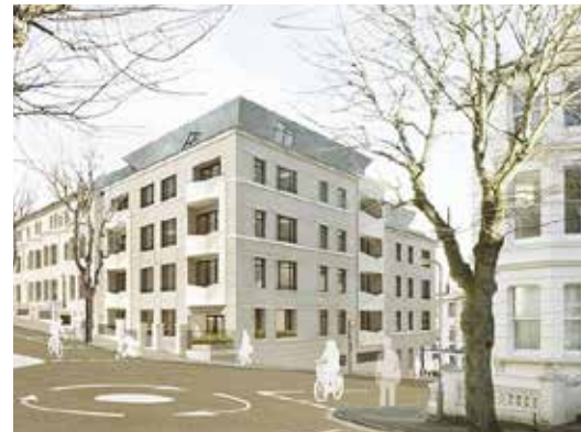
Buckingham Road BN1 3RJ