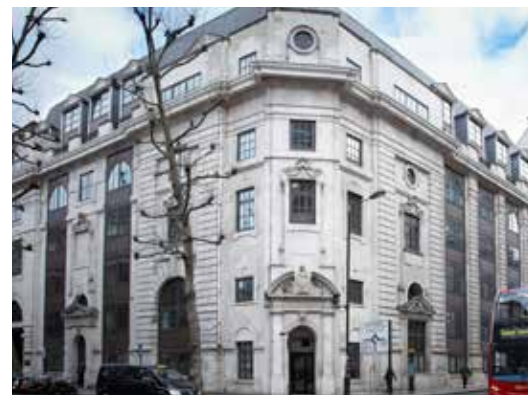
Ergon House SW1P 2AL