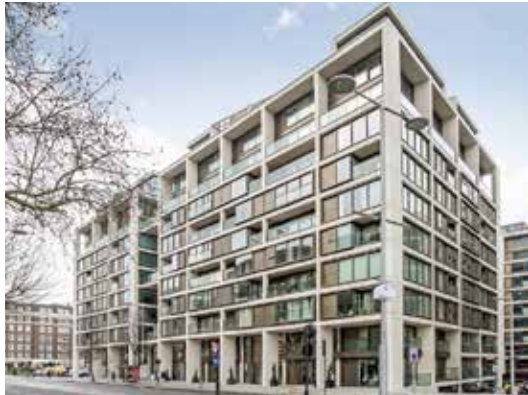
Kensington High Street W14 8QH