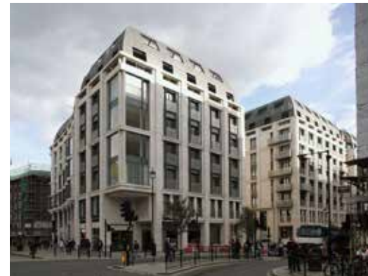
The Strand WC2R 1AB