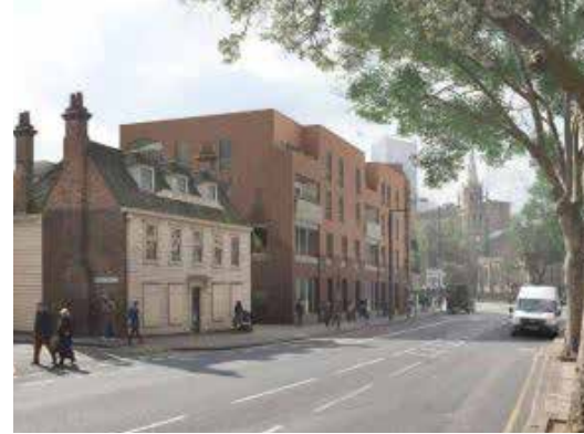
Stratford Office Village E15 4BZ